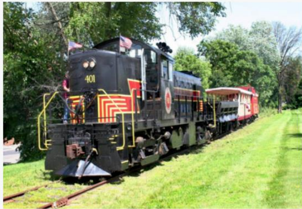
The Catskill Mountain Railroad has received three state grants for equipment and facility projects.

The grants, totaling $4.485 million, were among those awarded under the state's Passenger and Freight Rail Assistance Program [see " New York to fund more than $110 million in rail, port improvements ," Trains News Wire , March 13, 2024].